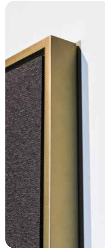
PUR12 Frame / Frame nature