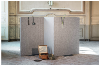
Full screen with flexible magnetic connection