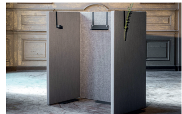
Flexible magnetic connection U-position