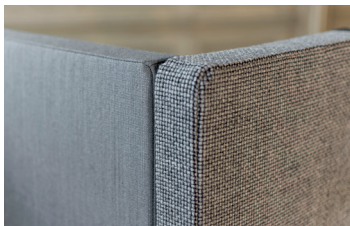
Full screen with magnetic connection without connecting post