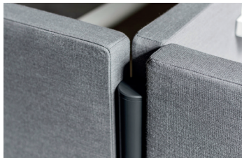
Full screen with magnetic connection with connecting post