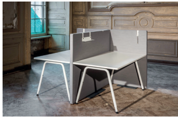
Flexible magnetic connection T-position