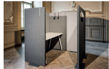
Flexible magnetic connection project workplace