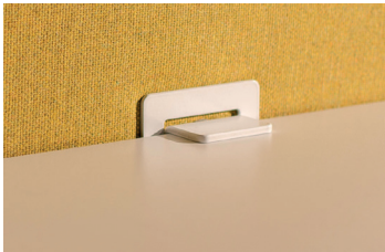
Connector element desk extension