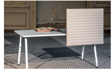
Behind-desk element divided with quilted design