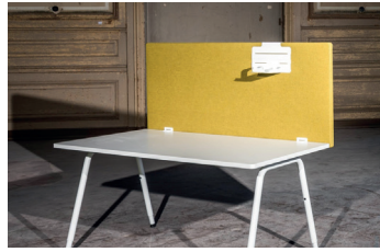
Behind-desk element with organisational accessory