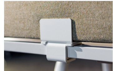
Connector element on-top extension