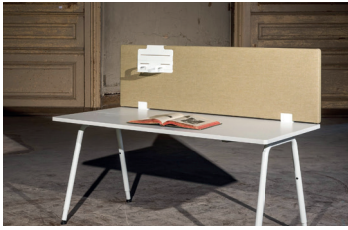
Desk-mounted element with organisational accessory