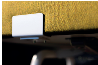
Connector element desk extension