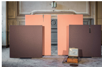
Solitary with organisational accessories