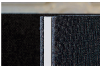
Solitary with inner profile RAL