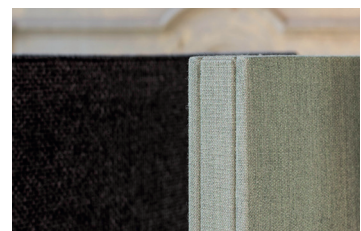
Solitary with inner fabric profile