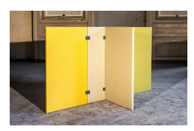
Flexible plug connection T-position