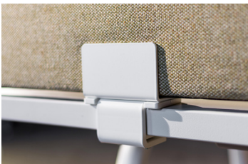
Connector element on-top extension