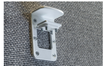
Connector element rear table