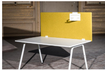
Behind-desk element with organisational accessory