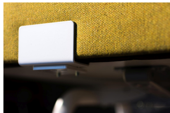
Connector element desk extension