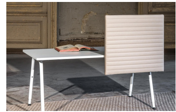
Behind-desk element divided with quilted design