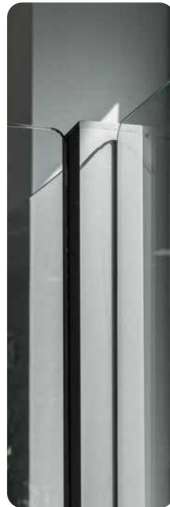
T-combination with glass topper

The Prime Line and Silence Line series offer a wide range of equipment variants, including the upgrading of table elements and movable wall elements with all-glass panels to increase the screening effect while maintaining the desired visual axes in the room. Acoustics and safety go hand in hand, so to speak, and can thus be designed very efficiently. Particularly for room situations that require a high protective screen, the movable wall systems with their glazing enclosed in the frame are ideally suited.