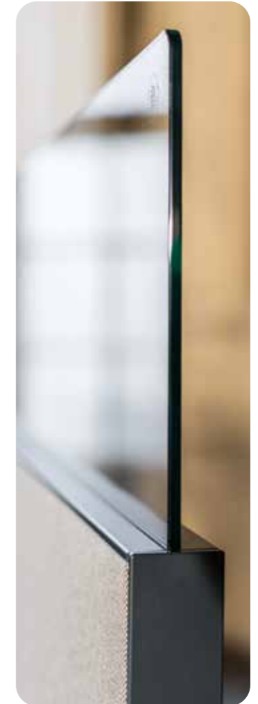
Silence Line element with glass topper