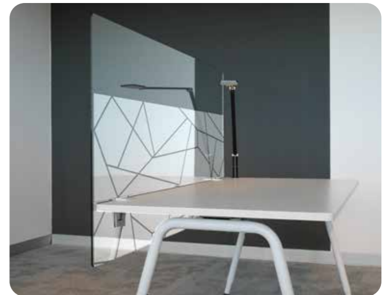
Top: Table top screen Bottom: Behind-desk screen with "mikado" foiling