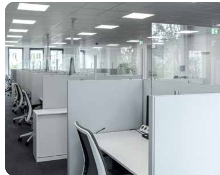
Top: Prime Line 55 table element with glass topper Below: Prime Line 40 movable wall and table elements with glass topper