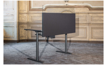
Desk element with glass top