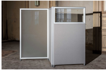
Glass wall and partially glazed wall