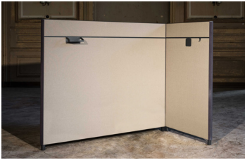
Full screen with organisational rail