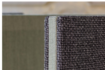
Solitary with inner fabric profile