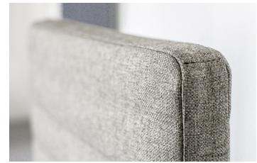
Solitary fully upholstered with quilting