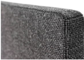
Solitary fully upholstered