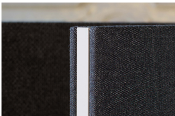
Solitary with inner profile RAL