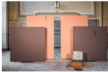
Solitary with organisation accessories